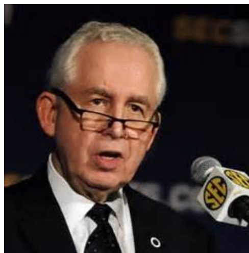
SEC Commissioner Mike Slive