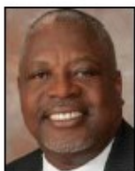
AL RAULS Buikhorn